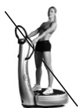
When training with the Power Plate machine, do not "lock" any joints, such as your knees and elbows, but keep them slightly bent.