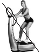
Don't lean on your heels too much. Balance your weight predominantly on the front of your feet.