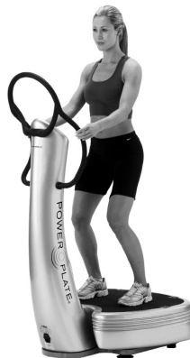
Legs slightly bent.