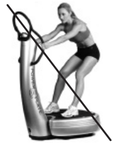
You always need to be balanced when standing on the Power Plate machine. Never hang on to the handles, use them only to maintain balance.